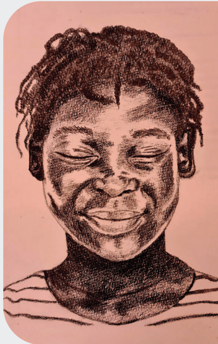
Artwork by Carrie Webb

24 weekly, three-hour creative arts courses in Trumpington, for disadvantaged residents, with the focus on mental health recovery.