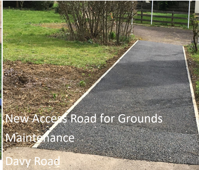
New Access Road for Grounds Maintenance Davy Road