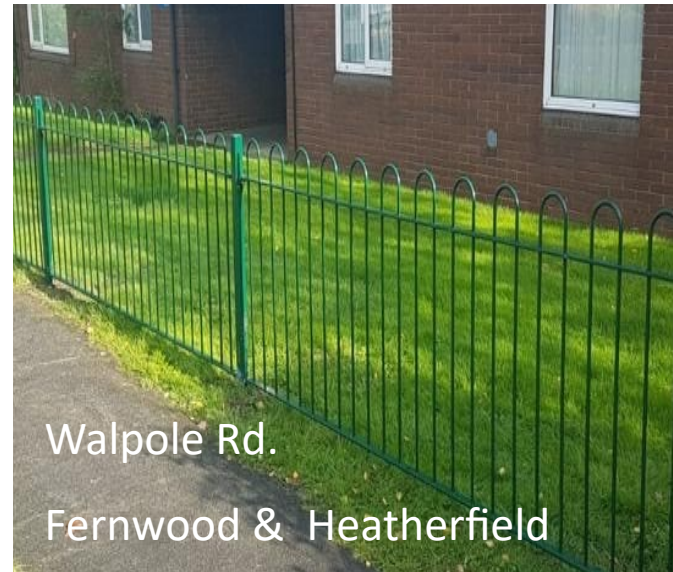
Walpole Rd. Fernwood & Heatherfield