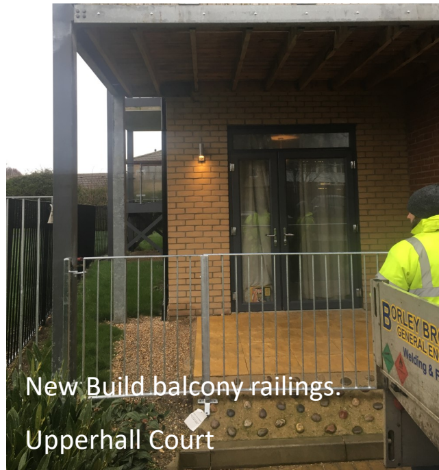
New Build balcony railings. Upperhall Court