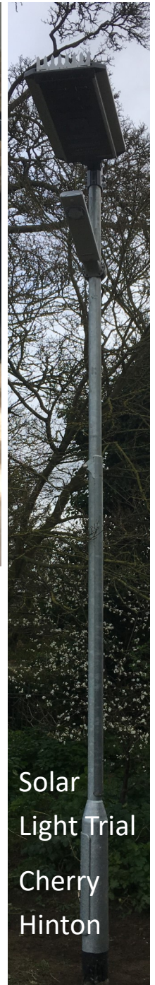
Solar Light Trial Cherry Hinton