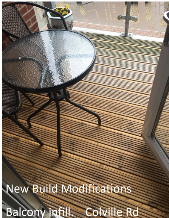
New Build Modifications Balcony infill. Colville Rd