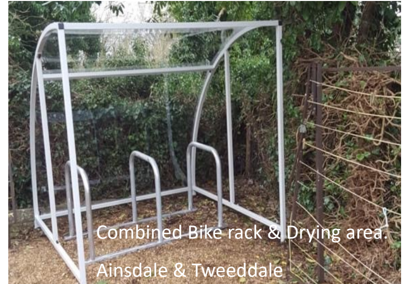
Combined Bike rack & Drying area. Ainsdale & Tweeddale