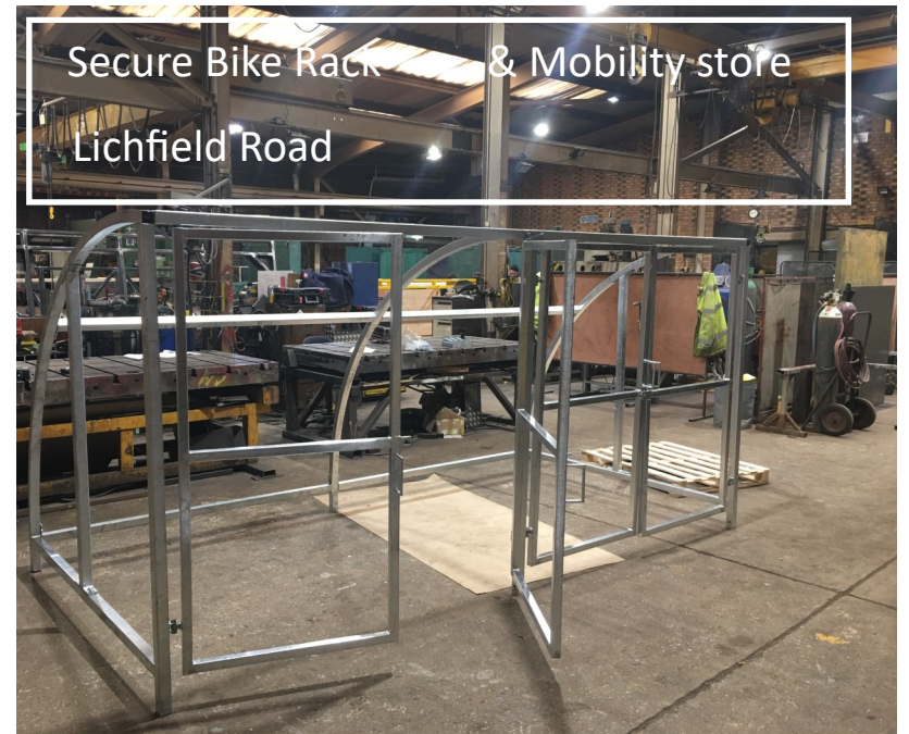
Secure Bike Rack & Mobility store Lichfield Road