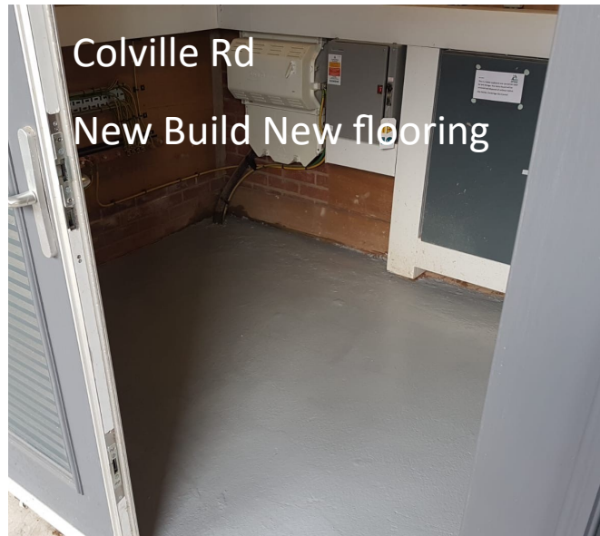
Colville Rd New Build New flooring