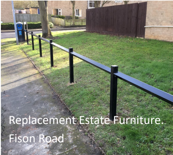
Replacement Estate Furniture. Fison Road