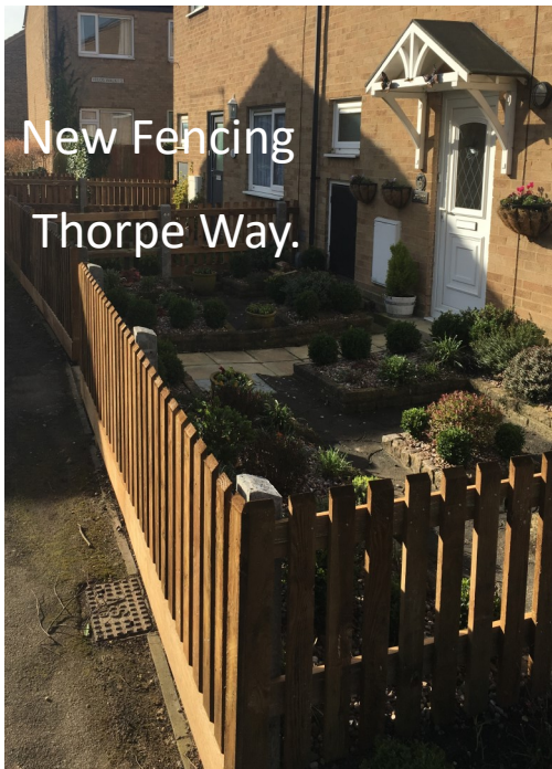
New Fencing Thorpe Way.