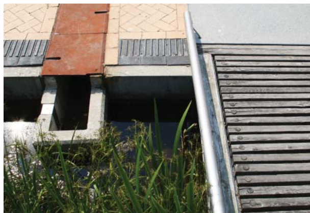
Rill leading to an urban wetland - Malmö