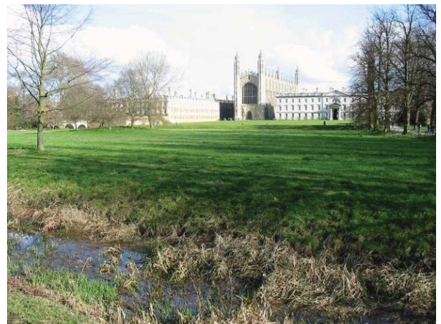
Wetland, The Backs, Cambridge