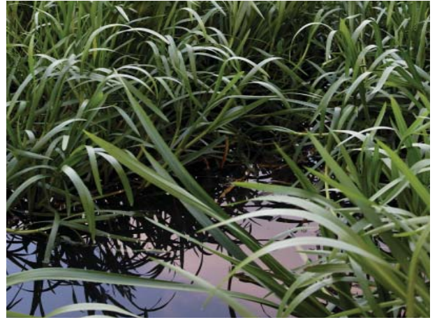
SUDS can replace lost wetland landscape

Open channels can be designed to be attractive with imaginative crossing points and are always a source of interest when rain brings them to life. Although they are not commonly used in the UK in modern housing, they were a common way of dealing with surface water in many historic cities, and the Cambridge examples, demonstrate that they can be used throughout the urban fabric of urban spaces.