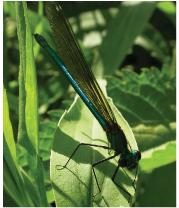
Banded Demoiselle Damselflies quickly take up residence in SUDS ponds