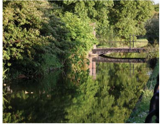
Hobson's Conduit – Water in the landscape in central Cambridge

It is important to remember that the primary and overriding function of SUDS is to drain surface water effectively, and this function must not be compromised by other design considerations. Effectiveness and quality of design must be considered together.