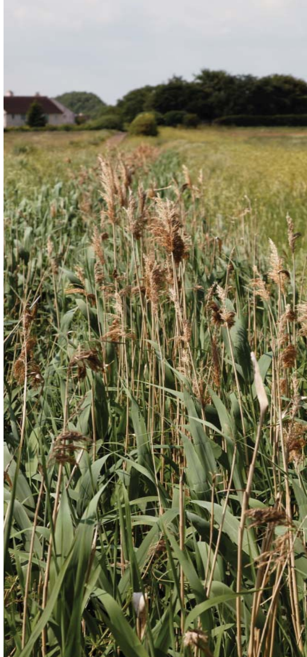
Watercourse at Clay Farm, in Trumpington with common reed

The flat gradients can cause problems for piped drainage because it often results in very deep trenches and large pipe diameters. SUDS can deal with the shallow or even totally flat gradients in the same way that nature has done, by using wide shallow features to manage water flows.