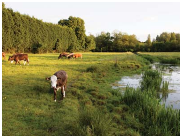
Sheep's Green water meadow near Cambridge city centre

Although clay soils may prevent a complete infiltration solution it will still be possible to use other SUDS features such as ponds, wetlands and swales. It is also possible to allow some water to soak into the ground, even if the drainage design calculations do not allow for it (for example out of the bottom of an unlined swale).