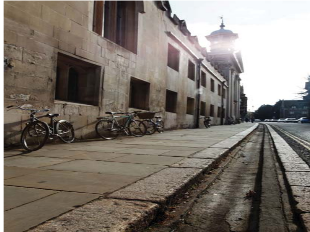
Hobson's Conduit in Trumpington Street

Another famous Cambridge characteristic is its water meadows or floodplain adjacent to the River Cam, which are in parts bounded by residential developments. These water meadows are often grazed and are unique in as much as they extend into the city itself, for example Sheep's Green. Again, these are a much loved feature and typify the Cambridge landscape.