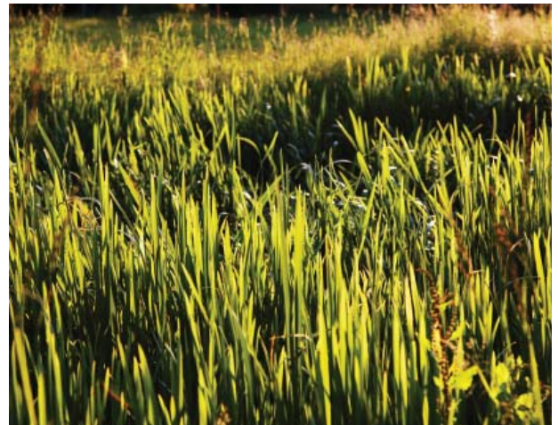
Coe Fen – Wetland in central Cambridge