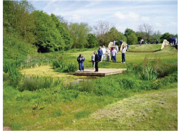
Children pond dipping in a SUDS feature

The Environment Agency promotes SUDS but the natural floodplain must be protected. Therefore the Environment Agency is unlikely to agree to the location of SUDS within a floodplain, since the SUDS feature will fill up with river flood water when the area floods and will not have capacity to hold the rainfall runoff from the site as originally intended. The features may also remove valuable flood plain storage.