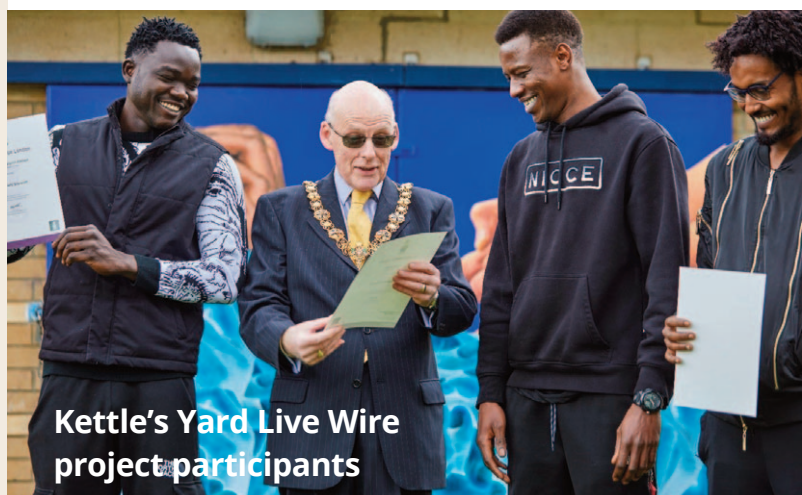
Kettle's Yard Live Wire project participants