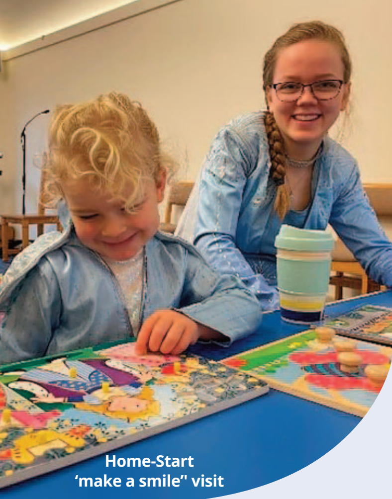
Home-Start 'make a smile' visit