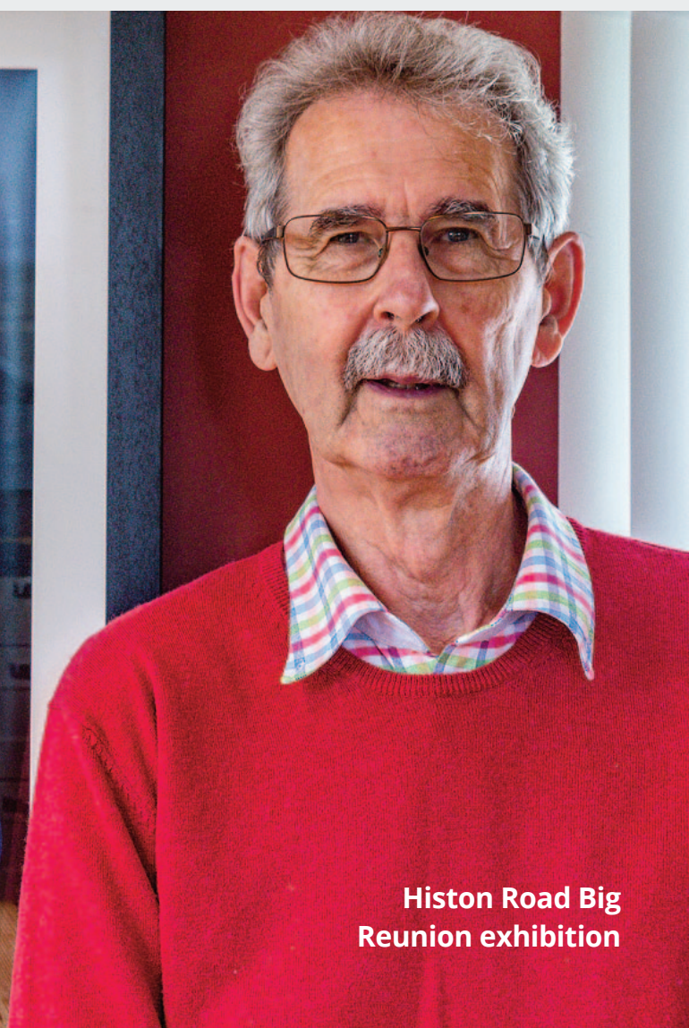
Histon Road Big Reunion exhibition