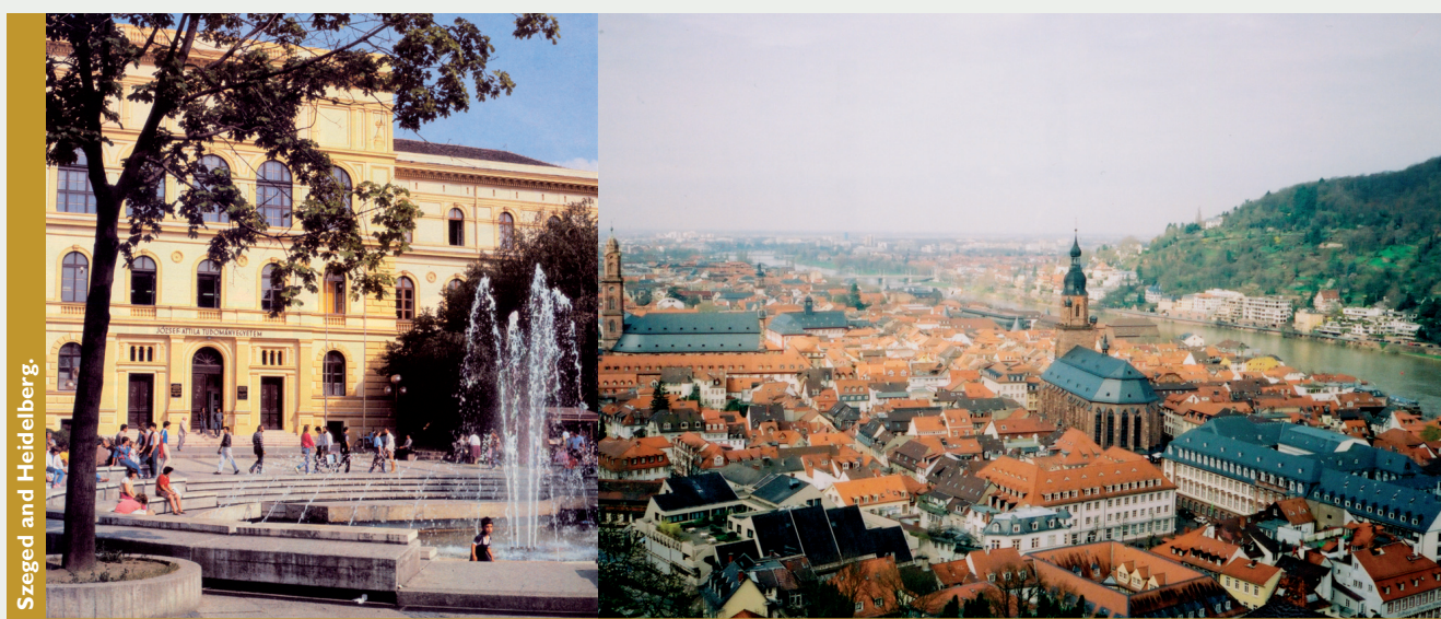
Szeged and Heidelberg.