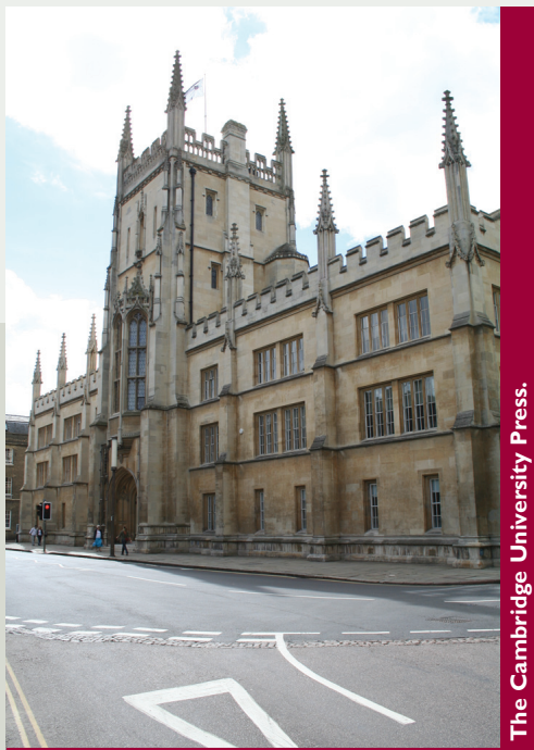
The Cambridge University Press.