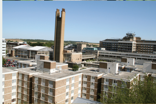
Old Addenbrooke's Hospital, Trumpington St. and new Addenbrooke's, Hills Rd.