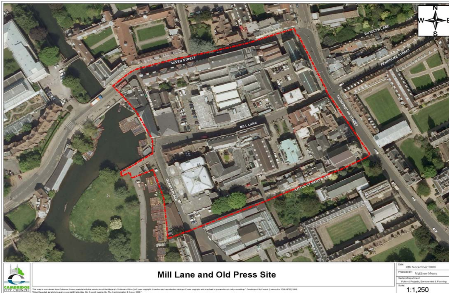
Figure 1: Location of the Old Press/Mill Lane site.