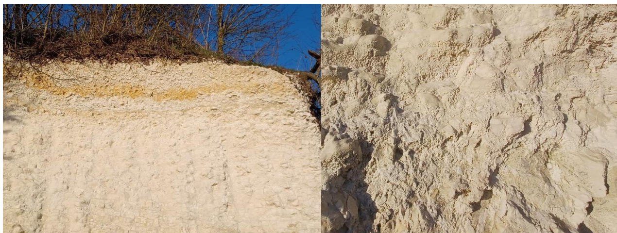
What's below our feet? Exposed chalk escarpment (Left) and a close-up of chalk fissures (Right).

create areas of high permeability. As rainwater is slightly acidic, it slowly weathers the chalk, enlarging these fractures over time.