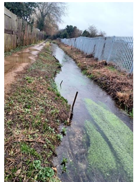
Cherry Hinton Brook, Starwort beds