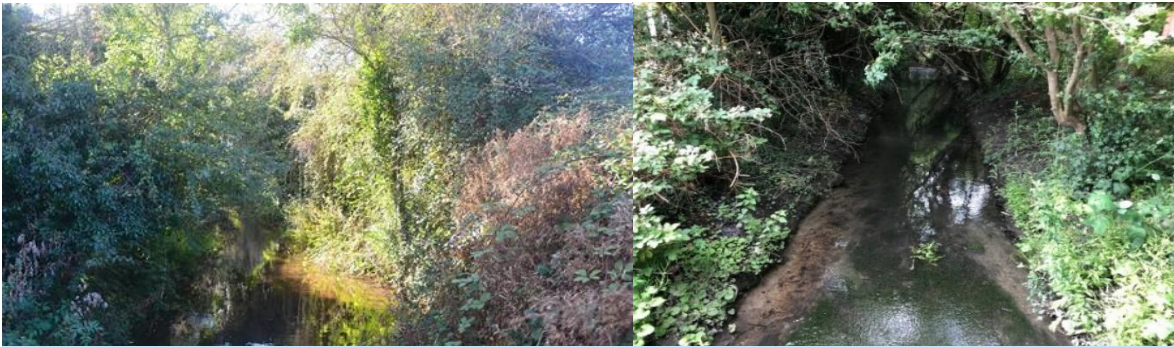
Coldham's Brook, degraded urban chalk stream