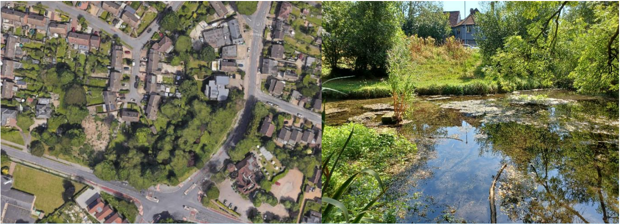
Giant's Grave, an urban springhead (Aerial view, Left), clear waters at the springhead (Right)

Giant's Grave Springhead is a critical source of flow for the surrounding chalk stream network. Here, the project will focus on improving water quality for better base flows. It will also improve habitat conditions to better support downstream biodiversity.