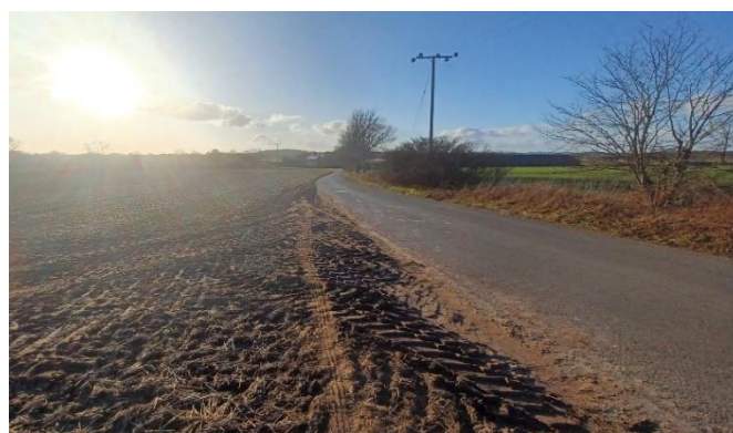
Poorly managed agricultural field, displaying soil erosion.

Intensive agricultural practices, such as excessive ploughing, monoculture farming, and overgrazing, lead to soil erosion. This erosion causes sediment runoff, which diminishes water clarity and smothers vital habitats like gravel riffles, crucial for species such as brown trout to spawn. Sediment also clogs the spaces between gravels, reducing oxygen levels and