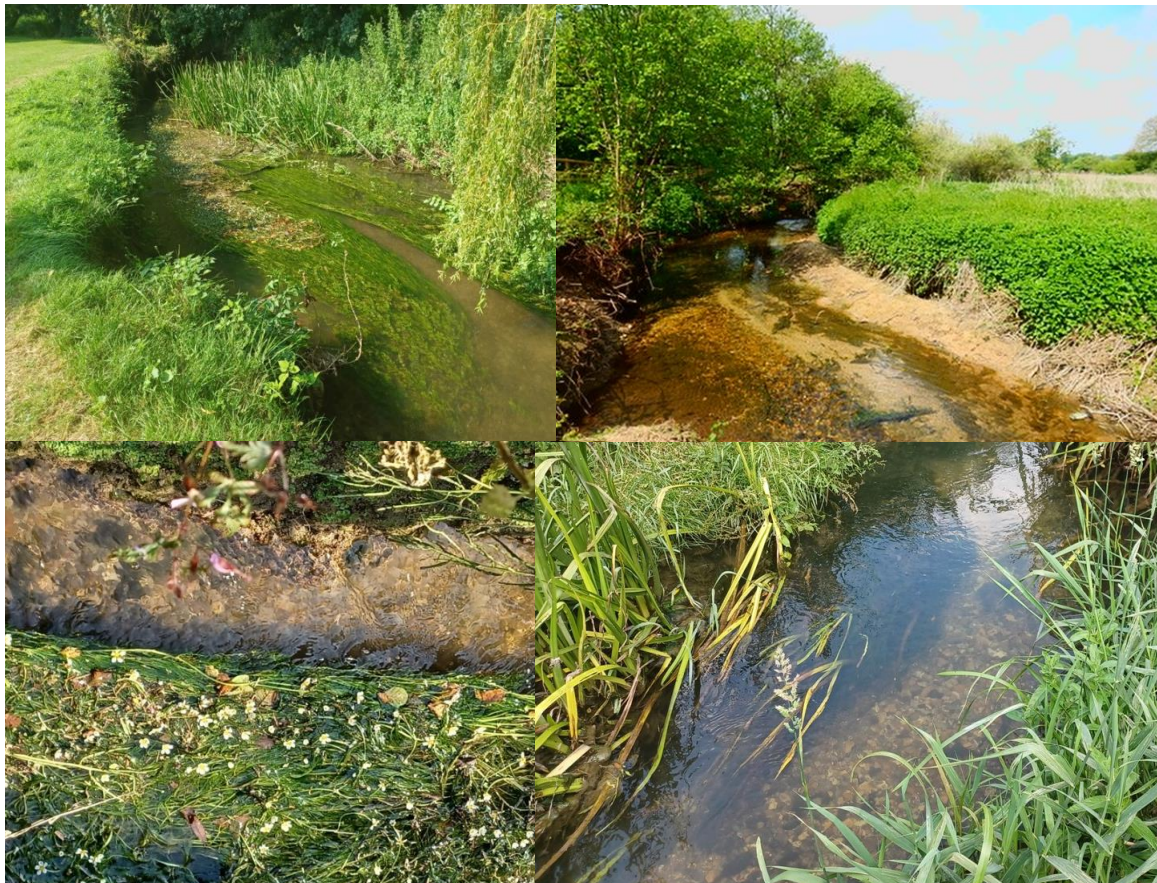
River Granta, Abington (Left)

To address these challenges, the river will be subject to initial baseline surveys to determine which targeted interventions are necessary to improve the health of the River Granta. Based on these surveys, interventions will include replanting riparian zones, channel re-meandering, and in-stream habitat enhancement.