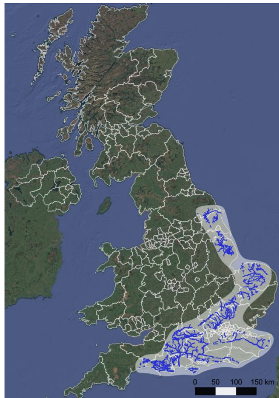
Map showing chalk stream distribution in England.

The distribution of chalk streams in England extends from the South to the East and further up along the Northeastern coast. Accurately determining the number of chalk streams in England remains challenging. Current estimates suggest there are over 200, but this figure is not definitive. This uncertainty arises partly because the full network of chalk streams, particularly in Greater Cambridge, has yet to be fully mapped. Additionally, many chalk streams have been altered, converted into agricultural drainage ditches, lost, or heavily modified by urban development. Furthermore, there is no standardised definition for classifying modified chalk streams, making it difficult for experts to develop a comprehensive assessment.