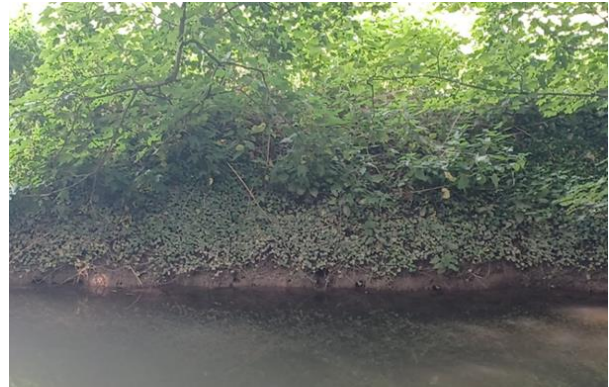
American signal crayfish burrowing increasing turbidity