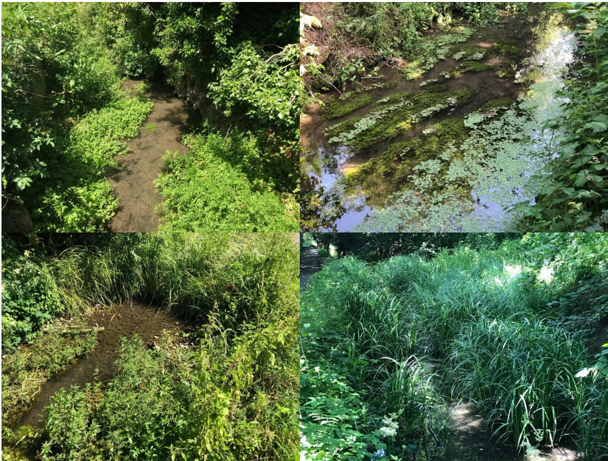
Hobson's Brook, a geodiverse urban chalk stream