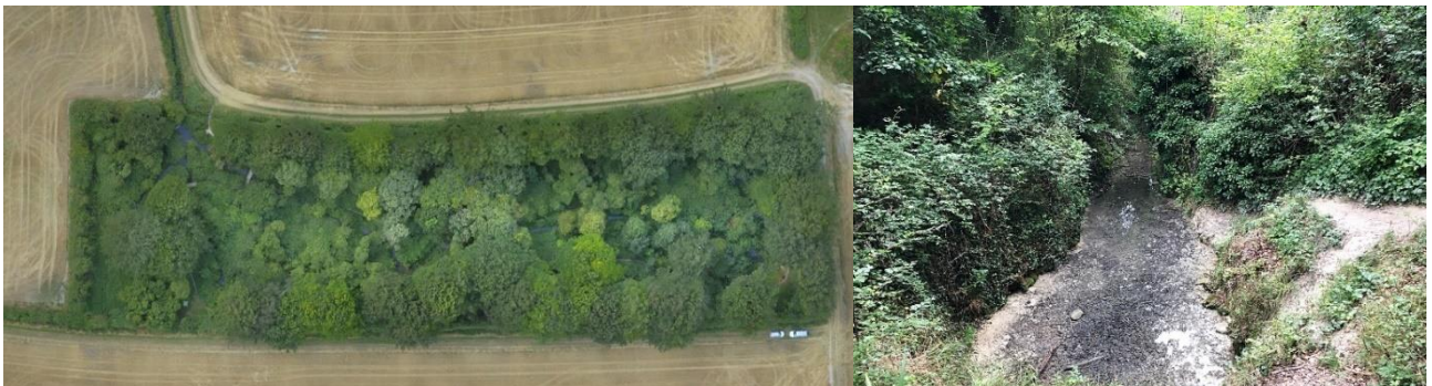
Nine Wells Springhead, a rural springhead (Aerial view, Left), clear waters at the springhead (Right)

Nine Wells Springhead is in an urban area. This case study site demonstrates the necessity of addressing low-flow conditions and urban pollution at spring sources. Habitat enhancements alongside methods of reducing sedimentation and nutrient loads will be implemented to restore this springhead.