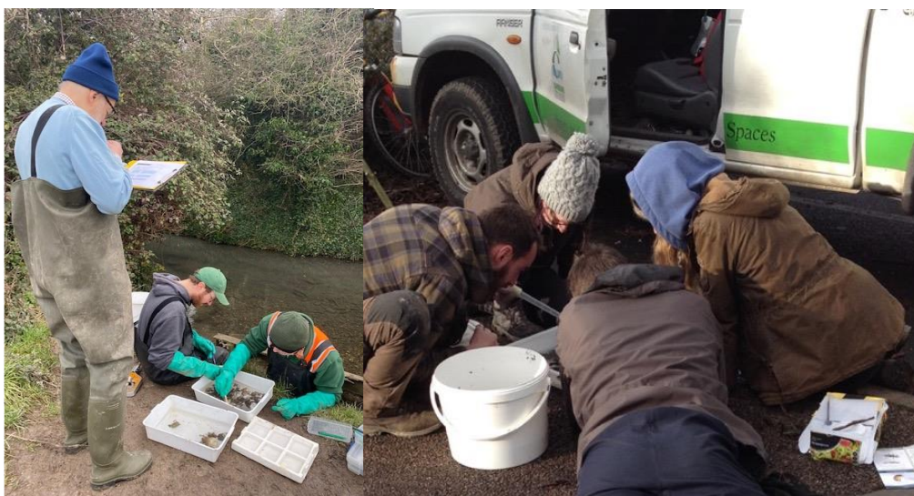
Cambridge City Council nature reserve volunteers, citizen science biological survey