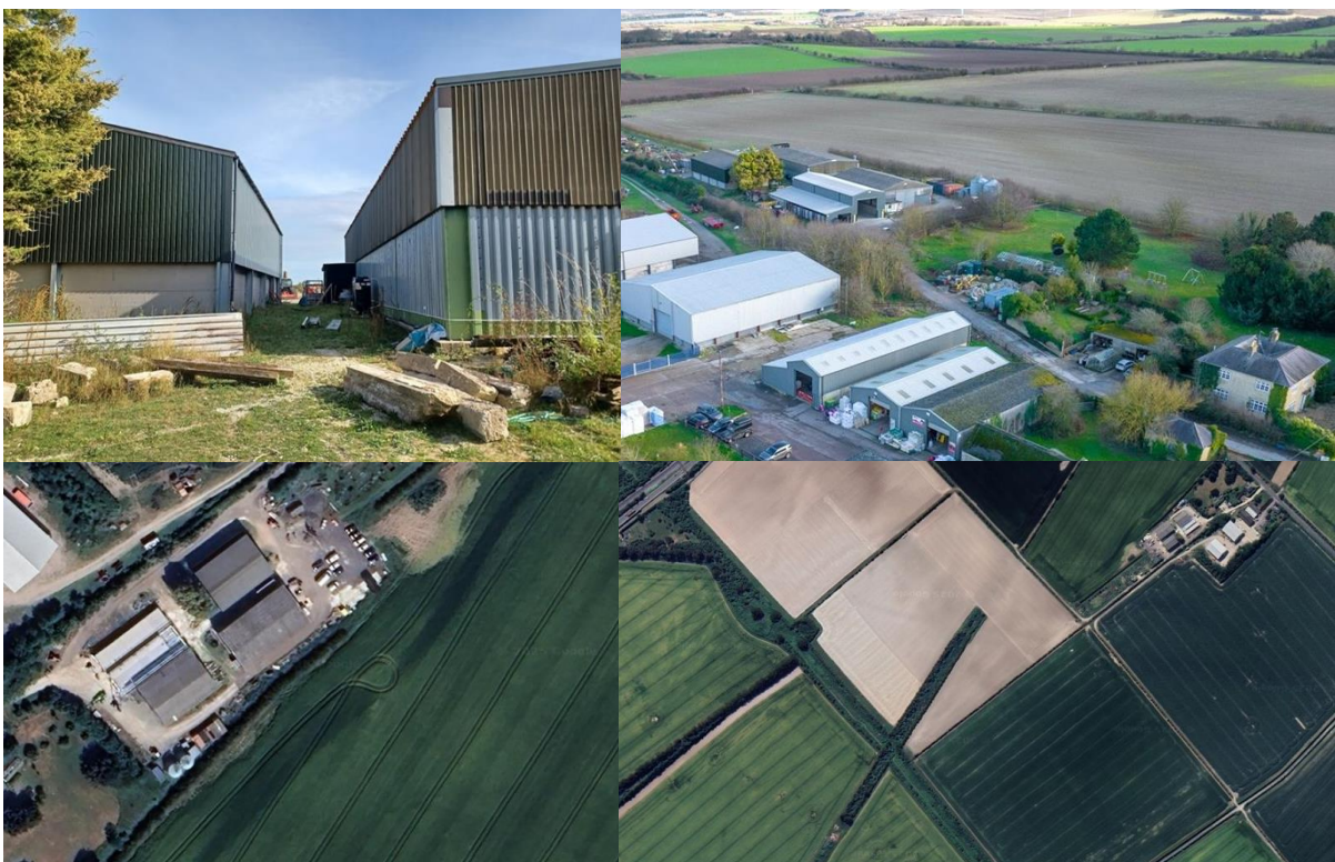
New Shardelowes Farm, a demonstration site for rainwater harvesting and regenerative farming practices

New Shardelowes Farm will serve as a living laboratory that demonstrates how regenerative farming can simultaneously improve agricultural productivity whilst reducing pressures on chalk streams.