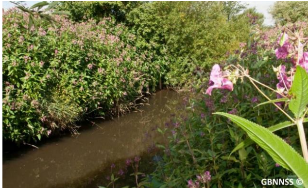
Himalayan Balsam growing beside a chalk stream

reduces biodiversity and destabilises the bank structure. Invasive aquatic species like the American signal crayfish also threaten chalk streams. These crayfish prey on native species like the white-clawed crayfish and cause physical damage to stream banks through their burrowing. This leads to increased sedimentation and turbidity in the water, further degrading stream health.