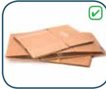
Large cardboard boxes (flattened)