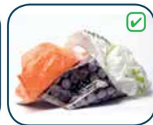
Plastic bags, film & wrapping