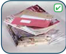
Paper, magazines & envelopes

ONLY ITEMS LISTED BELOW GO IN THE BLUE BINS, NO OTHER ITEMS PLEASE