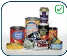
Cans & tins