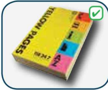
Phone books & catalogs